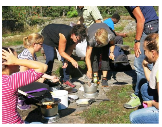
Making lunch outdoors together in the sun

According to the evaluation given by the participants at the end of the day, they were very pleased with the course. –This was an eye opening course for me, said one of the participants, who thinks that he will be using the methods learned in his work in the future.