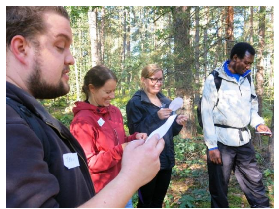
Self-recorded nature CD concert

The day consisted of altogether nine different activities, such as map- and GPS activities, making food outdoors and an outdoor version of the famous game Memory.